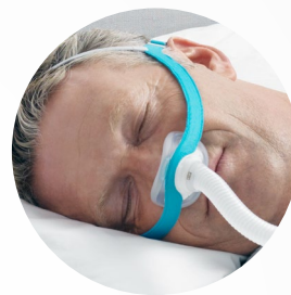
A full range of breathing comfort options