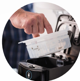
Easy-access water chamber for easy filling