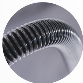
World-class humidification is designed to deliver a comfortable therapy