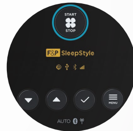
Simple menu allows for easy adjustments to your therapy

For more information, please ask your healthcare provider or scan the QR code to download the SleepStyle App from the App Store™ or on Google Play™.