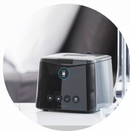
Quiet and compact

The beginning of anything new can be difficult, and it can take time to adjust to it. CPAP therapy is no different. With F&P SleepStyle™ we have worked to understand the daily interactions you will have with your new device, and make these as easy as possible – so you can get set up and started, simply.